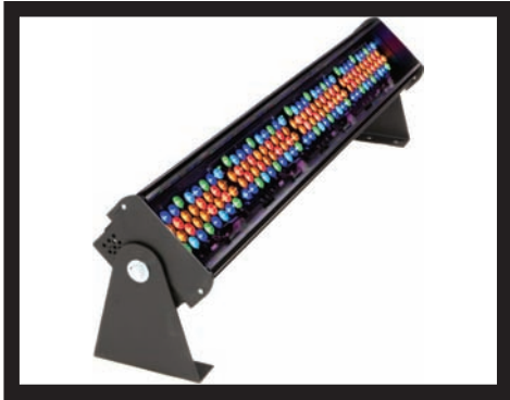
* Four Cell unit shown with optional floor trunnions

The Selador Series medium power, low-profile Paletta fixture is ideal for stage and studio lighting as side light, down light, fill light or cyc lighting – producing the widest range of spectrally balanced saturated and tinted colors that lighting designers love. The Paletta fixture uses the x7 Color System™ configured for the deepest, purest colors and tints available. The exclusive 7-color array maximizes Paletta for deep color output but does not give up Selador Series' unique ability to match match warm, tungsten white light, vibrant daylight white, and soft, tinted gel colors.